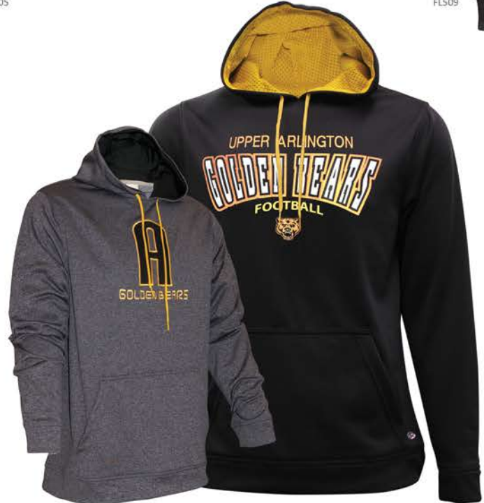
FL500 Graphite Body Color Shown