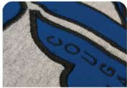
Vapor Fill Upcharge applies to Tackle Twill and Vapor fill.