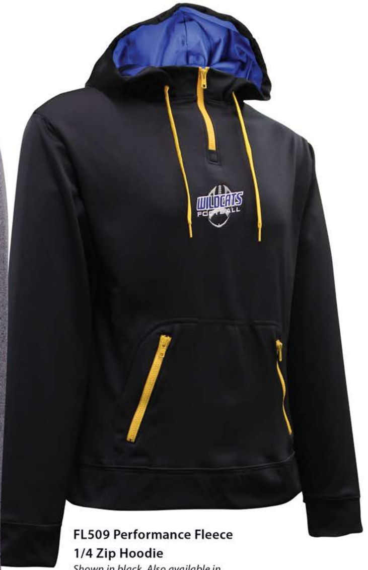
FL509 Performance Fleece 1/4 Zip Hoodie Shown in black. Also available in graphite heather.