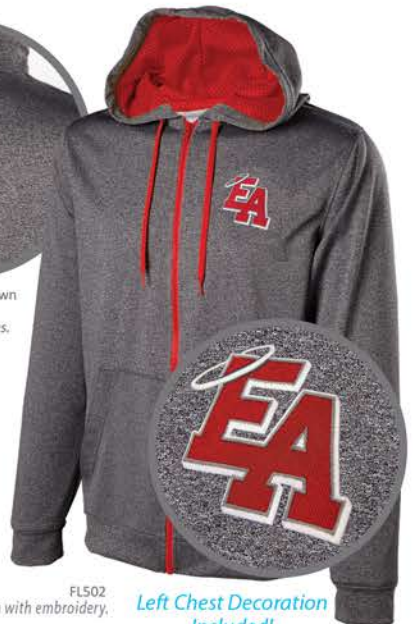
FL502 Shown with embroidery.

Back option shown EMIQ vertical Upcharge applies.