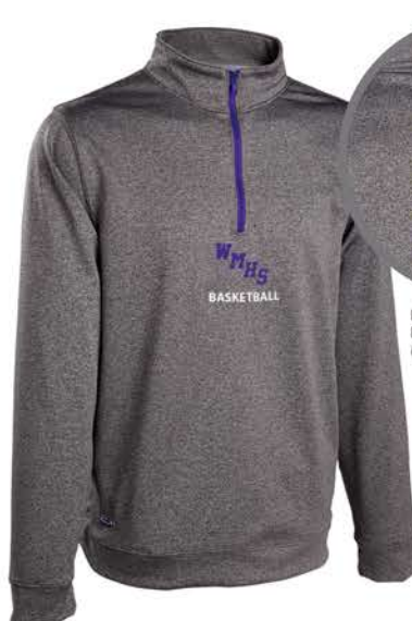
FL503 Shown with EMPF1 full front graphic.

Ask your Neff Sales Rep for full details for screenprint pricing on all N-Tek Fleece garments.