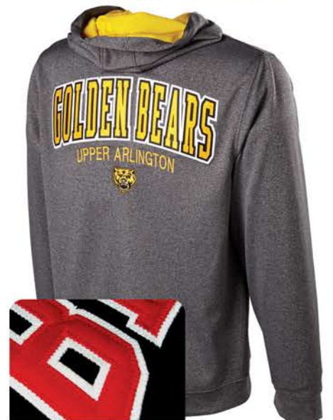
2-3 layer tackle twill Upcharge applies to FL500, FL502 and FL503