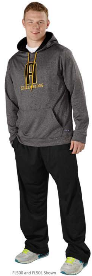
FL500 and FL501 Shown