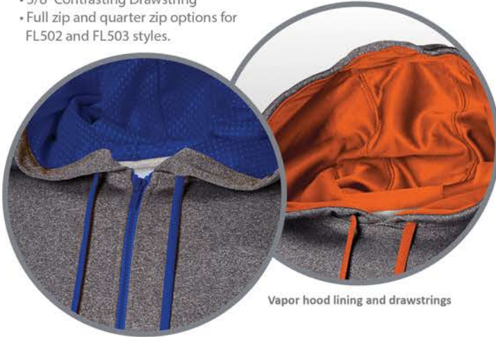
Mesh hood lining, drawstrings and zipper