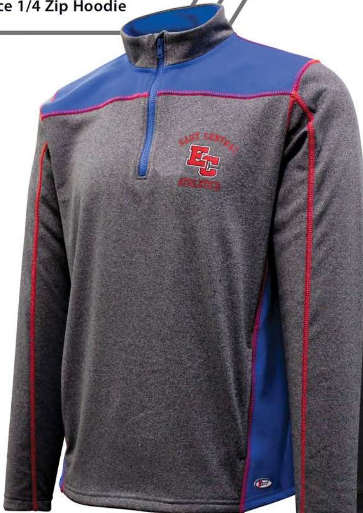
OW505 Hybrid Performance Fleece w/contrasting softshell inserts Shown in graphite heather fleece. Also available in black.