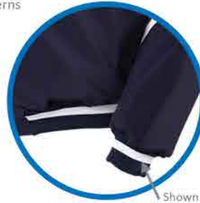
Shown with pattern 6N