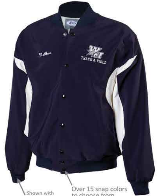
Shown with pattern 5N